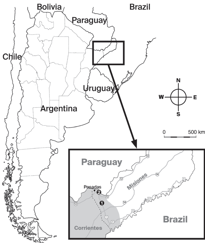
Figure 1. Sites of collection of ectoparasites. Locality 1: Estación Experimental del Instituto Nacional de Tecnología Agropecuaria (EEA INTA) Villa Miguel Lanús (27°25'S; 55°53'W). Locality 2: Estancia Santa Inés (-27° 31' S; -55° 52' W). Grey indicates the ecoregion Fields y Malezales.

Data analyses. Since only 12 individuals of N. lasiurus were captured at EEA INTA, and both sites of collection are close and similar in their vegetation, data from both localities was analyzed together. Indices and parameters were calculated as follow: Ectoparasite specific richness ( S = \text{number of species} ), Shannon specific diversity index [ H = -\sum (p_i \ln p_i) ], equitability index ( J = H/\ln S ), mean abundance (MA = total number of individuals of a particular parasite species in a sample of a particular host species/total number of hosts of that species, including both infected and non-infected hosts) and prevalence [ P = (\text{number of hosts infected with one or more individuals of a particular parasite species}/\text{the number of hosts examined for that parasite species}) \times 100 ] (Begon et al. 1988; Bush et al. 1997). We tested significance ( P ) of differences between mean