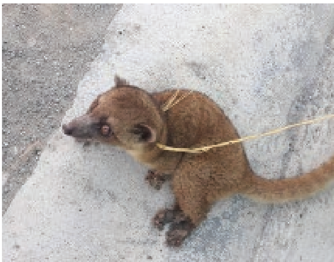
Figure 1. Adult female of Bassaricyon medius captured by inhabitants of urbanización El Recuerdo, Montería, Córdoba. The specimen was delivered to members of the Biodiversidad Unicórdoba Research Group.

The new record of B. medius comes from the Colombian Caribbean and it is based on photographs of a single live adult female (Figure 1), and the preserved skull of the same specimen (Figure 2). The photographs supplementing this record (Figure 1) were donated by members of the Urbanización Los Recuerdos community, municipality of Montería, Department of Córdoba. The specimen was delivered