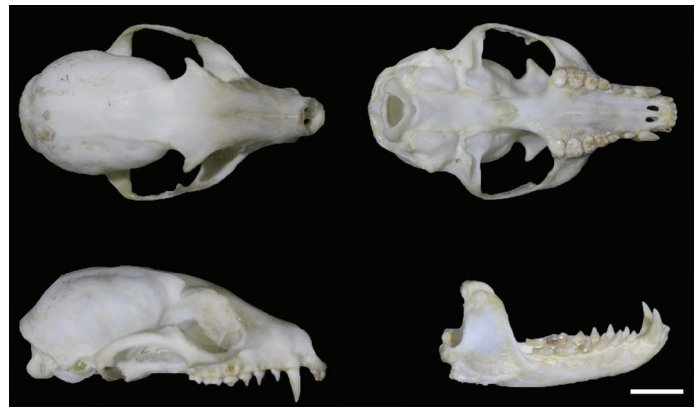
Figure 2. Skull of an adult female Bassaricyon medius (CZUC-M 0246) from the Municipality of Montería, Department of Córdoba, Colombia. Scale = 15.0 mm.