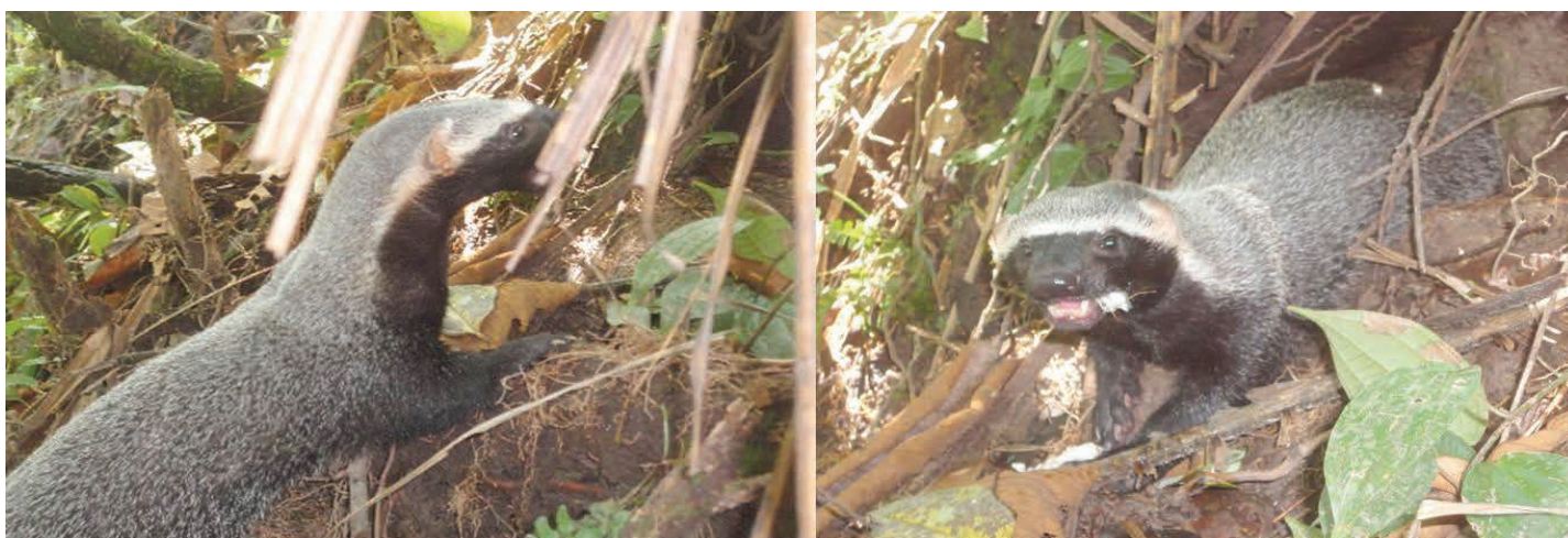
Figure 2. Photographic record of G. vittata in the jurisdiction of La Soledad, municipality of Rio Quito.

There is currently scarce information about the biology, ecology and distribution of this rare species ( G. vittata ) in Colombia (Calderon-Capote et al. 2015). As it is rarely observed, it has been listed as a priority species in the research of small carnivores in Colombia (González-Maya et al. 2011; Suarez-Castro and Ramirez-Chaves 2015). The profound transformation of natural ecosystems in Colombia — particularly in the Pacific region currently under deg-