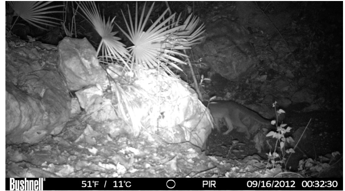
Figure 2. Photograph of a wild Puma ( Puma concolor ) in the Sierra del Tentzo Protected Area.

A photograph of an adult puma was captured at 00:32 hours on September 16 near a dry river bed at an elevation of 1,680 m (Figure 2). In the same camera trap, we captured other species like ringtail ( Bassariscus astutus ), and grey fox ( Urocyon cinereoargenteus ); other cameras also recorded white tailed deer ( Odocoileus virginianus ) and coyote ( Canis latrans ). Dis-