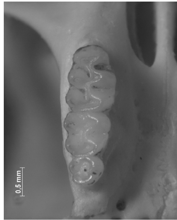
Figure 2. Right upper tooththrow of Calomys hummelincki (MZUSP 25729).

separated by small elevations, locally known as “tesos”. The ground cover is predominately grasses surrounding rocky outcrops. The vegetation is usually sparse, except on top of the “tesos” (Vanzolini and Carvalho 1991; Carvalho and Carvalho 2012). The climate in this region is characterized by a rainy season from April/May to August/September and a dry season from October to March. Average temperatures range between 22° and 30° C. Annual rainfall for 1989 was 1,884 mm (see Vanzolini and Carvalho 1991; Carvalho 1992).