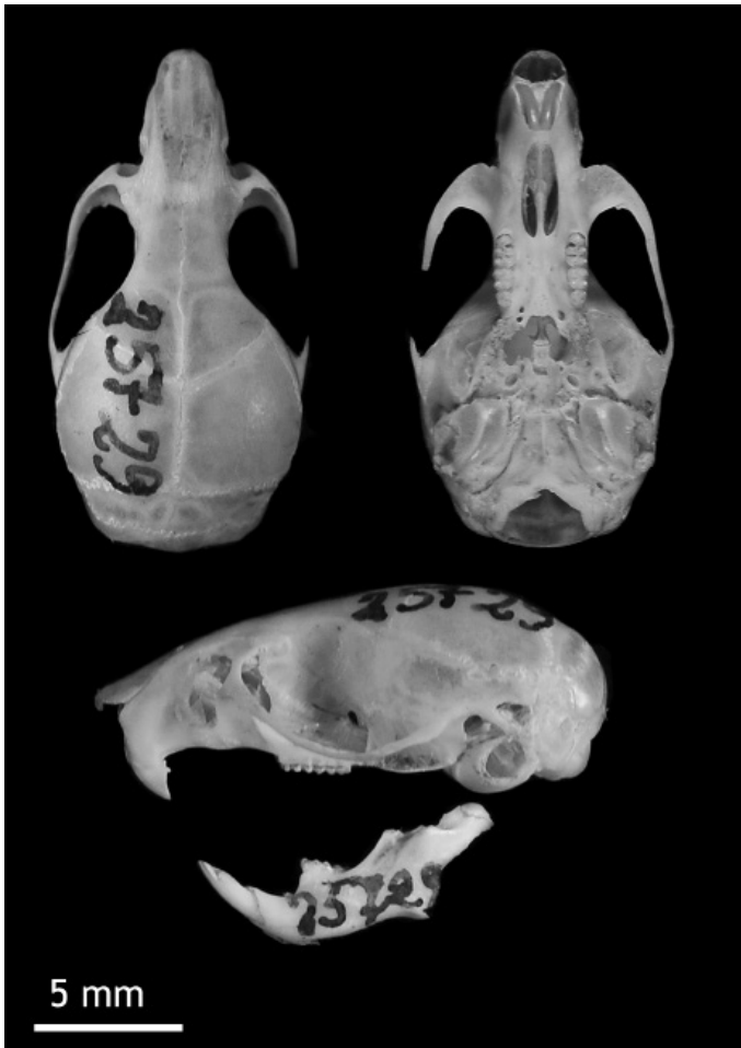
Figure 1. Dorsal, ventral, and lateral views of the skull, and lateral view of the mandibles of Calomys hummelincki (MZUSP 25729).

The collection site is within an area locally known as “lavrado”, a local term used for the savannas that occur in the general area and that form part of the Rio Branco-Rupununi bioregion (see Voss 1991: figure 38). The topography of the region is dominated by interconnected streams (“igarapés”)