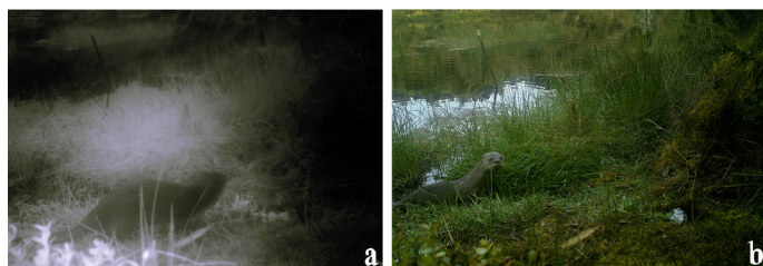
Figure 2. Records of L. longicaudis from municipality of Chinavita at 3,110 m a) Third record at 06:54, on November 28. b) Fourth record at 09:03, on November 28.

BRIONES-SALAS, M., M. A. PERALTA-PÉREZ AND E. ARELLANES. 2013. Análisis temporal de los hábitos alimentarios de la nutria neotropical ( Lontra longicaudis ) en el río Zimatán en la costa de Oaxaca, México. Therya 4:311-326