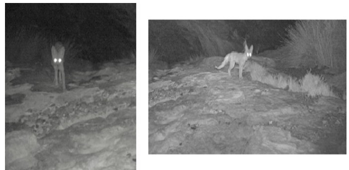
Figure 1. First photographic records of Vulpes macrotis in APFFVC.

El Junco is characterized for being an isolated site with virtually no impact by anthropogenic activities. Rocky substrates in streams and slopes are not the type habitat for V. macrotis , although there are some records in similar topographical conditions, as was the case reported in the state of Sonora (Verona-Trejo et al. 2012). It is known that the fox is vulnerable to predation in these sites (Cyper et al. 2013). The presence of the desert fox is likely occasional in the new record, as the slopes in the