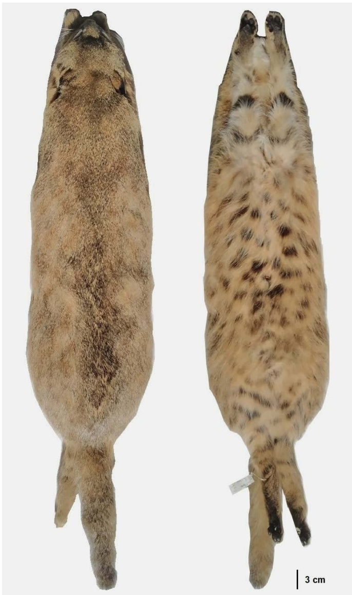
Figure 3. Dorsal and ventral views of the skin of the neotype specimen (MNHN 2432) of Leopardus fasciatus (Larrañaga 1923), female, collected in 1971 at Estancia San Cristóbal, Arroyo Limetas, Conchillas, Department of Colonia, Uruguay.

been traditionally described as showing bicolored feet ( i. e. , talons black versus paler dorsal side), our revision of Uruguayan specimens showed a great degree of variation in this trait (Figure 2). Notwithstanding, whereas it is worth mentioning for completeness, the fact that Larrañaga did not refer to this trait in his description is beyond the point. What stands out is that, despite Larrañaga's succinct description of fasciatus , the naturalist clearly distinguished between Azara's "pajero" ( i. e. , F. pajeros Desmarest, 1816) from the specimens he used for describing his fasciatus for Uruguay. In sum, Larrañaga made undoubtful morphologic and geographic observations that best fit the description and distribution of L. munoai and not that of L. pajeros . This is contrary to what has been supported elsewhere ( e. g. , Ximénez et al. 1972 ; Nascimento et al. 2020 ), yet our argumentation is void of speculative claims based on partial and subjective interpretations of Larrañaga's description of F. fasciatus .