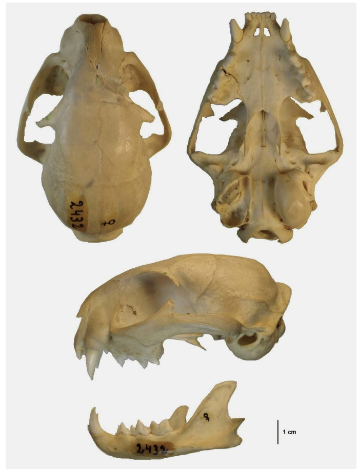
Figure 4. Views of the skull (dorsal, ventral, and lateral including mandibles) of the neotype specimen (MNHN 2432) of Leopardus fasciatus (Larrañaga 1923), a female collected in 1971 at Estancia San Cristóbal, Arroyo Limetas, Conchillas, Department of Colonia, Uruguay.

In sum, Felis fasciatus Larrañaga, 1923 represents the oldest available Linnean name for the Uruguayan pampas cat (see also Klappenbach 1997 ), an endemic species of the Uruguayan Savannah ecoregion ( Tirelli et al. 2021 ). Accordingly, in compliance with the Principle of Priority of the International Code of Zoological Nomenclature ( ICZN