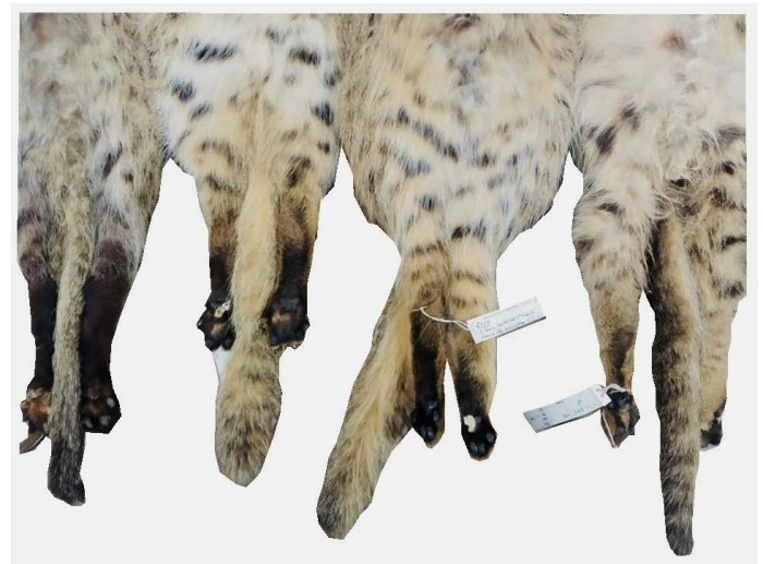
Figure 2. Ventral views of sample skins of Leopardus fasciatus (Larrañaga 1923) showing the variation from dark to lighter-colored talons, left to right, for Uruguayan specimens MNHN 1315, MNHN 2780, MNHN 2432 (designated neotype), and MNHN 4706, respectively.