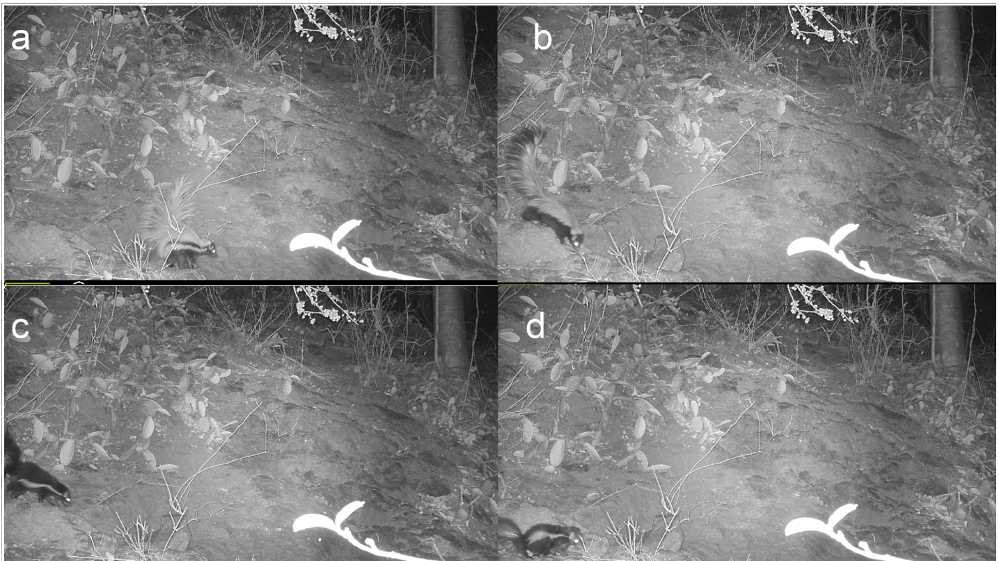
Figure 2. Observation of different individuals of Mephitis macroura in the waterhole in the Ejido Rancho El Salado, Puebla, in central México. The coloration pattern varied from almost white (a, b) to almost black (c, d).

We received logistic support from the Facultad de Ciencias Biológicas, Benemérita Universidad Autónoma de Puebla, and Red de Biología y Conservación de Vertebrados of the Instituto de Ecología, A. C. We appreciate the field help by local people of the Ejido Rancho El Salado. The authors thank the anonymous reviewers as well as the people who collaborated during field work. This research was funded by Consejo Nacional de Ciencia y Tecnología (CONACyT) by the project CB-2015-01-256549.