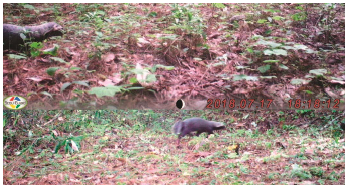
Figure 1. Photographic evidence of the Greater Grison ( Galictis vittata ) on “El Cielo” Biosphere Reserve Tamaulipas, México, in a pine-oak forest.

One camera trap recorded two photos of a Greater Grison in 2018; the first on 17 July at 1818 H and the second on 1 November at 1052 H (Figure 1). These photos clearly