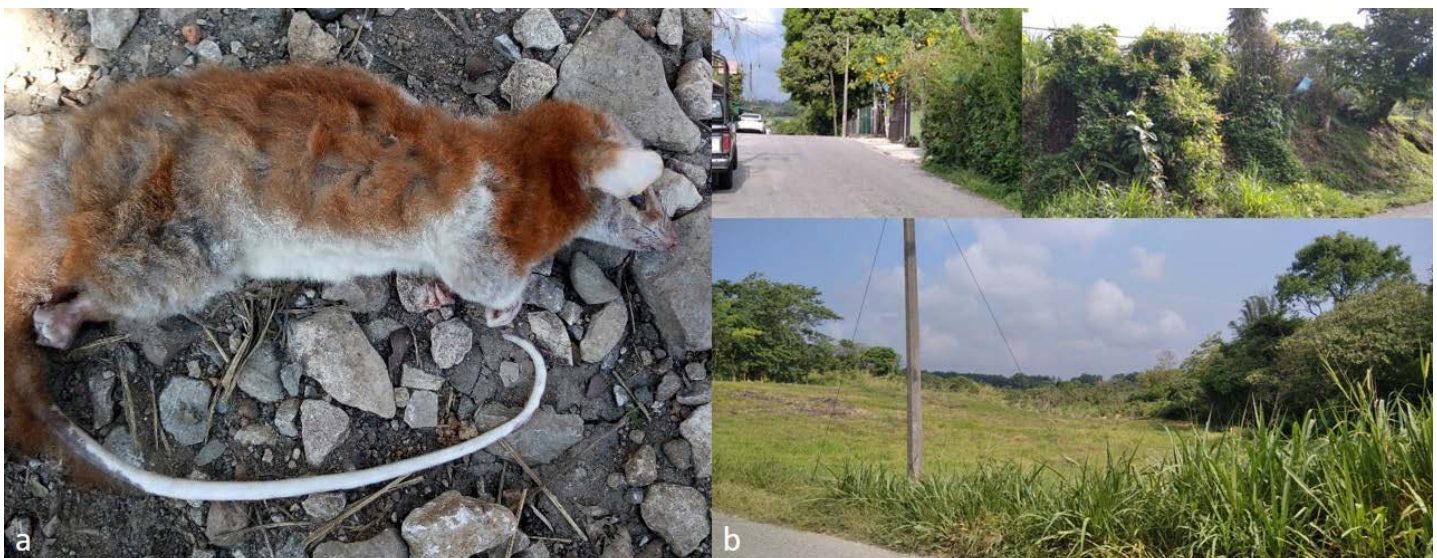
Figure 1. a) Female specimen of the Derby's woolly opossum, Caluromys derbianus , roadkilled in Peñuela town, Amatlán de los Reyes, Veracruz, México; b) habitat in the locality where the roadkill of C. derbianus occurred.

The skin, skull, and axial skeleton of the specimen were preserved and deposited under accession number IIB-UV 4322 in the Veracruz Mammal Collection (registry number VER.-MAM-191-10-06 SEMARNAT) of the Instituto de Investigaciones Biológicas (Institute of Biological Research) at Universidad Veracruzana.