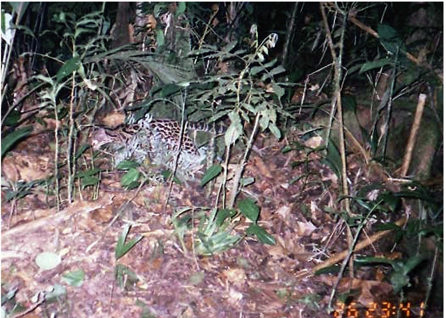
Figure 2. Photographic record of margay ( Leopardus wiedii ) in the Mario Dary Rivera University Biotope for Quetzal Conservation, Baja Verapaz, Guatemala. The distinguishing features of margays include a very long tail measuring up to 70 % of the head and body length.

The margay is strongly associated with forest habitat/tree cover, from continuous forest to small forest fragments (de Oliveira 2011), under moderate levels of habitat modi-