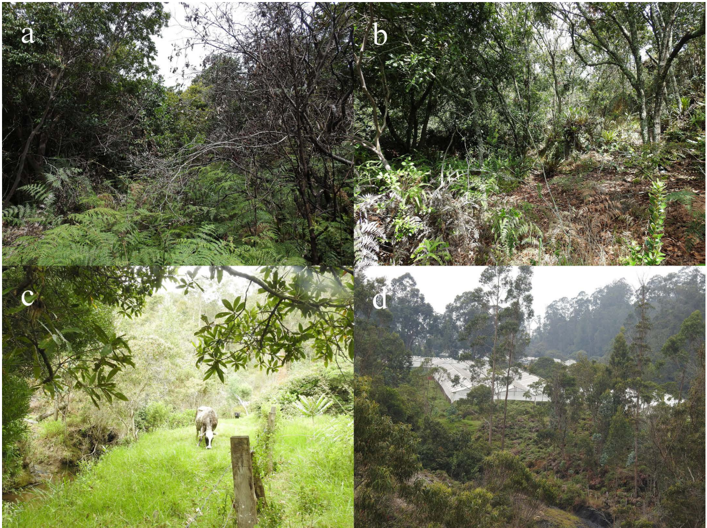
Figure 2. Coendou vestitus habitat and anthropic activities around. a) Habitat characteristics of the first record. b) Habitat characteristics of the second and third records. c) Livestock next to the Quebrada de Piedras. d) Agriculture activities.

The three subadults/adults records of unknown sex were found resting in trees of secondary growth forest fragment next to an area recently affected by a fire caused in 2019, and that is currently in a process of ecological succession (Figure 2a). The first record was found at 1.70 m above the ground on a branch of a gague or cucharo ( Clusia multiflora : Clusiaceae; April 8, 2020; Figure 3e, f.), and the second and third record at about 4 m above the ground on a branch of a roble ( Quercus humboldtii : Fagaceae; June 7, 2020 and June 8, 2020; Figure 3a, b, c, d). The roble tree is situated about 10 meters inside the forest from the edge outside the farm, a lotic body of water locally known as Quebrada de Piedras (Figure 2b). This section of the forest fragment is surrounded by human activities such as livestock and agriculture (Figure 2c, d).