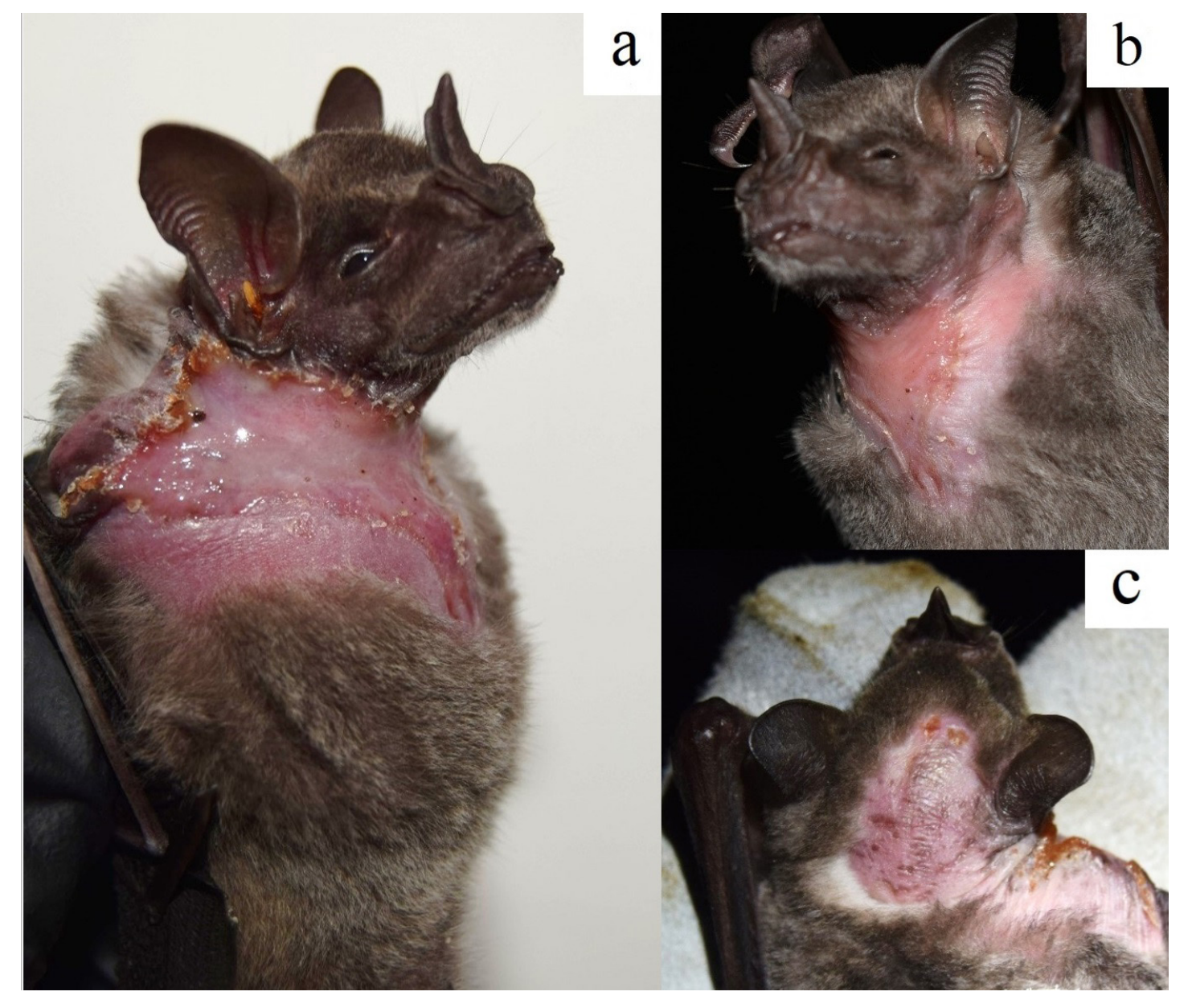
Figure 2. Alopecia in an adult male of Artibeus jamaicensis (ECO-SC-M 10238) captured in Ejido Berlín, municipality of Córdoba, Veracruz, México. Alopecia affected a) and b) the chest and neck, and c) the head and right shoulder.