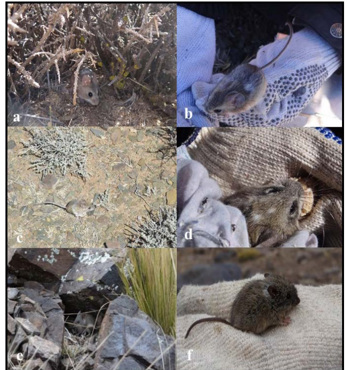
Figure 2. Leucism in 3 species of small rodents in the Argentina Puna Desert, province of San Juan Argentina. Eligmodontia sp. (a, b, c), Phyllotis xanthopygus (d) and Abrothrix andina (e, f).