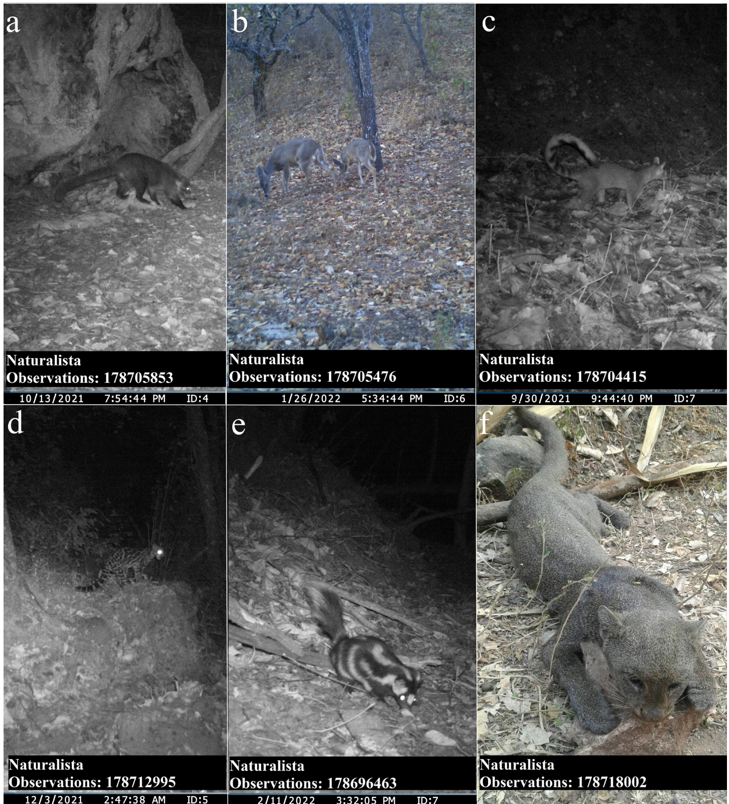
Figure 3. Photographic records obtained by camera trapping of Nasua narica (a), Odocoileus virginianus (b), Bassariscus astutus (c), Leopardus wiedii (d), Spilogale angustifrons (e) and Herpailurus yagouaroundi (f) in the community of Ahuitla belonging to the agrarian nucleus of Atlixnac, Guerrero, México.