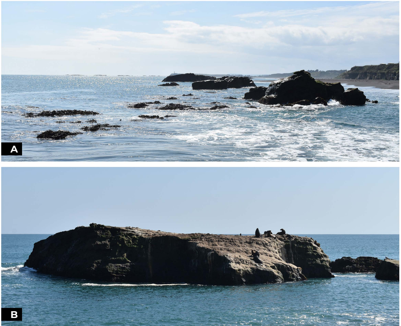
Figure 2. A) “Cabo Carranza rookery” Región del Maule, Central Chile during September 2020; B) individuals (up) on the rock and the copulating couple (below).

Pinnipeds have amphibious lifestyles with a combination of marine feeding and terrestrial reproduction. Regarding the above, the production is highly seasonal and synchronized with slight interpopulation differences, where climatic oscillations could influence variations of these stages and their noticeable seasonality ( e.g. , El Niño Southern Oscillation - ENSO) which in turn impacts the food availability ( e.g. , Sielfeld and Guzmán 2002 ; Oliveira 2011 ; Elorriaga-Verplancken et al. 2016 ), anthropogenic disturbances (including fishing activity) that modify population dynamics ( e.g. , French et al. 2011 ; McHuron et al. 2017 ), or physiological factors ( e.g. , Boyd 1991 ). In fact, during ENSO 1997/98 event Sielfeld and Guzmán (2002) reported at the breeding rookery of Punta Patache, numerous abortions, and premature birth since October 1997, with a maximum intensity during December 1997, and massive starvation of yearling and females in emaciated conditions, apparently caused by lack of anchovies, its main food item ( Sielfeld et al. 2018 ).