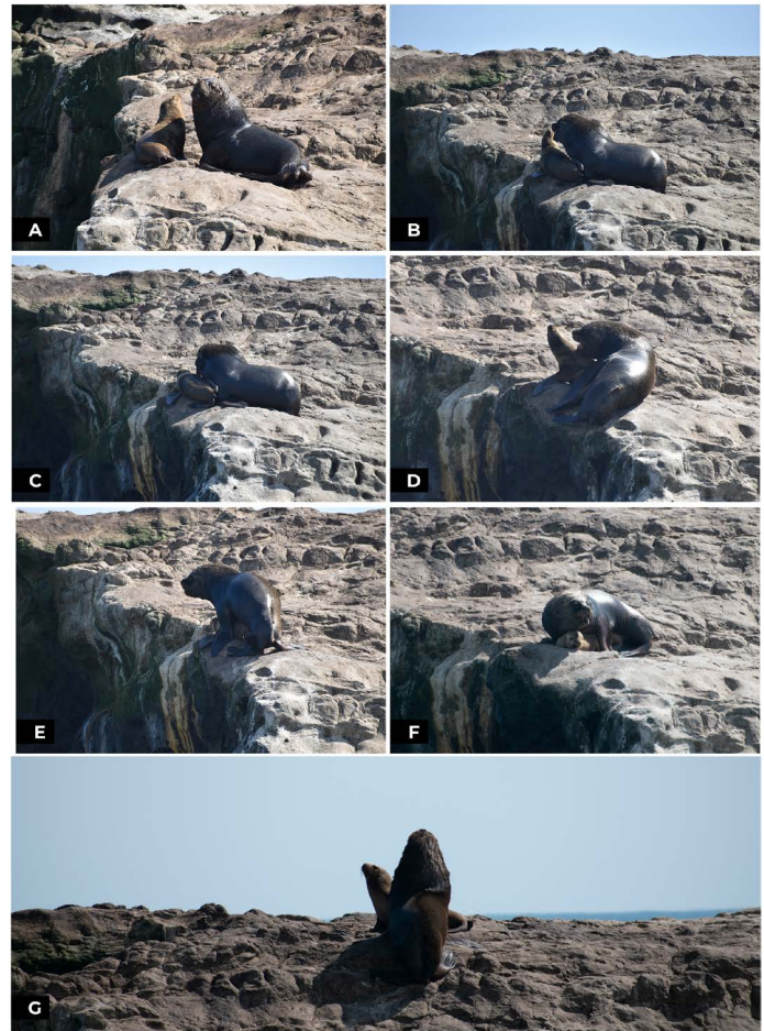
Figure 3. Record of the off-season reproductive activity of Otaria byronia at Cabo Carranza rookery. From A to D courtship ritual prior to mating; E and F mating process (copulation) and G, end of copulation event.

A possible hypothesis to explain the previous cases could be the independent or combined action of the mentioned factors on change of the foraging area, physiological and nutritional stress disturbing the timing of the reproductive cycles leading to delayed implantation, abort gestation, advancing the oestrus, or changes in other life history parameters. The mating reported in this note evidenced that the female was receptive to the male, suggesting that her oestrus cycle began earlier than usual. The interaction between the copulatory couple was like the dynamics observed during the reproductive season of this species, although without the competition and the frequent harassment from neighboring males. Since the South American sea lion reproduction takes place during the austral summer (e.g., Pavés et al. 2005, 2011 ), especially during January and February, this reproductive behavior in early September is therefore unusual for this species. So, to fully understand whether this event is results of environmental, anthropogenic, physiological factors or combination of