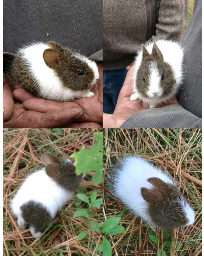
Figure 2. Juvenile individual of volcano rabbit ( Romerolagus diazi ) with leucism.

There is a report of gregarious or sedentary individuals with leucism, a phenomenon that could be associated with small and isolated populations, as reported for shrews and birds (Bensch et al. 2000; Chetnicki et al. 2007; Contreras-Balderas and Ruiz-Campos 2011), similar to the case of the volcano rabbit. The fragmentation of natural habitats reduces structural connectivity between patches, limiting the dispersal capabilities of individuals and restraining gene flow. This ultimately leads to changes in the distribution of genetic variability among populations due to inbreeding (Gurrutxaga and Lozano 2006), with negative effects on the fitness and fertility of individuals (Hedrick 2011). Although the fragmentation of the volcano rabbit habitat in the study area has not led to loss of genetic variability, it has caused a marked genetic structuring and a reduction of effective population sizes (Montes-Carreto et al. 2020). The presence of an individual with leucism is relevant as it corresponds to an endangered species; although leucism has not been reported to date in the population of the volcano rabbit living in the Chapultepec Zoo, attention should be paid to the sighting of