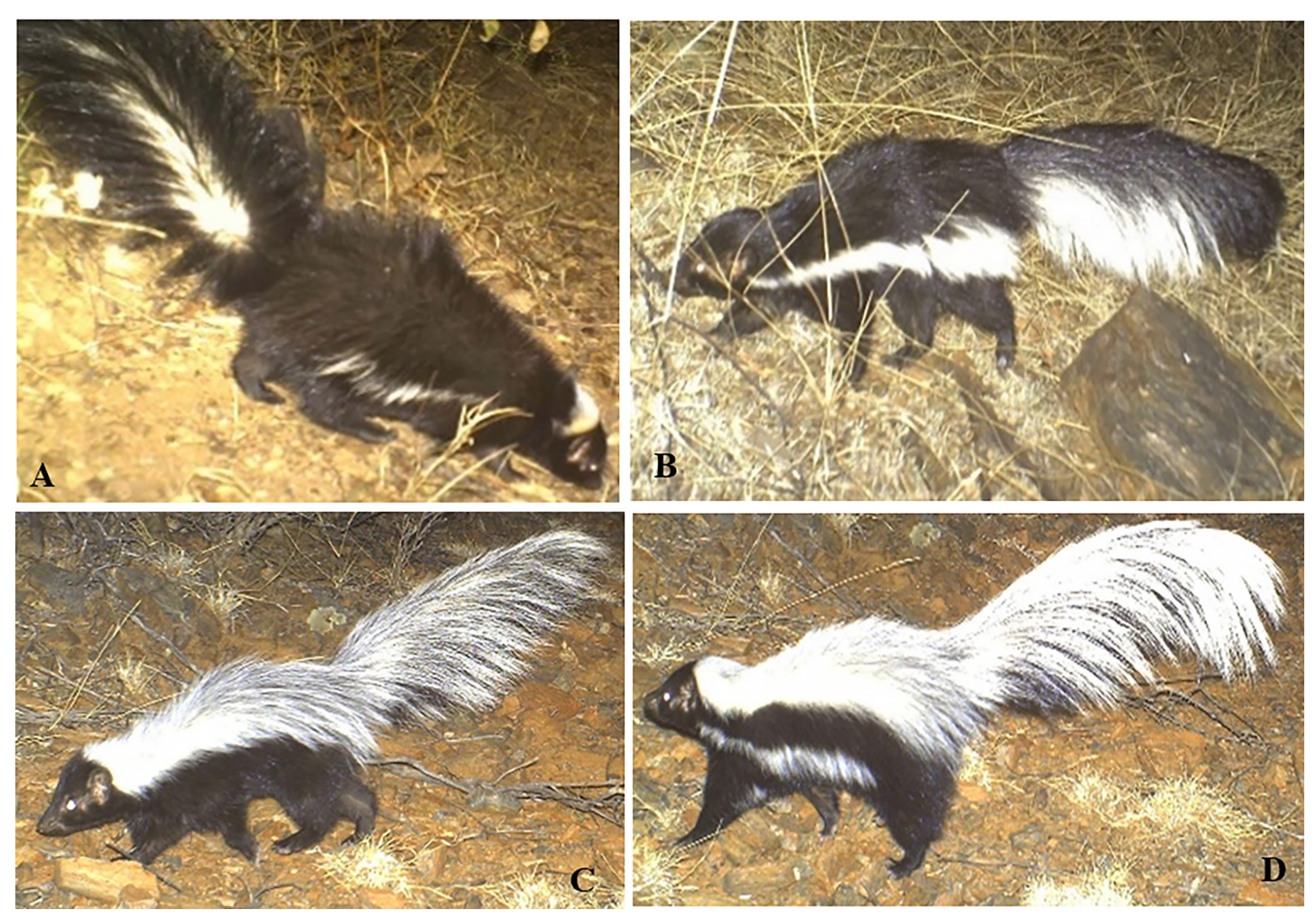
Figure 2. Color patterns of hooded skunk, Mephitis macroura in Cosoltepec, Oaxaca, México. A: Hooded; B: Lined; C: Silvered; D: Banner-bearer.

In the rainfed crop area (corn, beans, and squash), characterized by sparse plant cover, no Banner-bearer individuals were recorded; this finding suggests that the rainfed crop area does not favor conspicuous individuals (Fay 2017; Fisher and Stankowich 2018). In contrast, only 8 % of the individuals were recorded in the dry deciduous forest, belonging to the Lined and Banner-bearer types (Figure 3). Only a single individual (Silvered) was recaptured with the same camera-trap in induced grassland during the prerainy and rainy seasons.