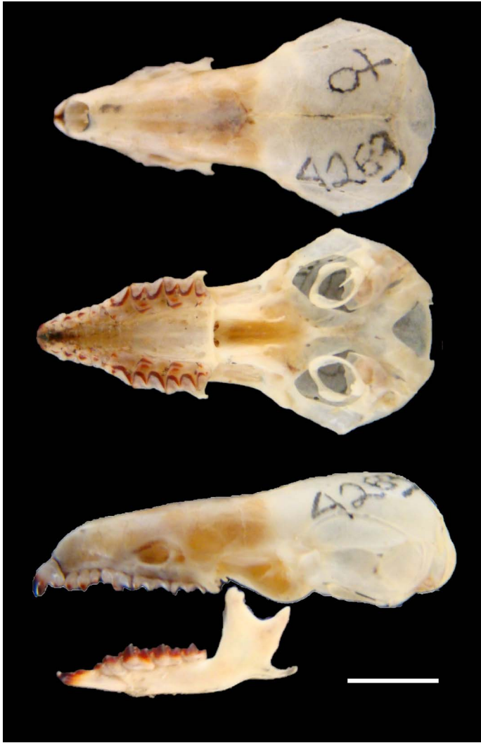
Figure 1. Specimen of the Phillips' small-eared shrew, Cryptotis phillipsii , collected in San Miguel Panixtlahuaca, Oaxaca (OAX.MA 4263). Bar indicates 5 mm.

the greatest diversity of shrews in the Americas occurs, the discovery and description of new species, rediscoveries, and range extensions within this family are yet common (Cervantes et al. 2008; Lorenzo et al. 2019). Of the 5 extant genera of shrews in the Americas, small-eared shrews of the genus Cryptotis have the widest distribution extending from eastern North America to the north of South America (Woodman 2019). The genus attains its greatest diversity in the northern tropics of southern México, particularly in the State of Oaxaca, including the presence of sympatric and syntopic species (Guevara and Cervantes 2017). Most of the species of Cryptotis in Oaxaca are relatively homogeneous in external and cranial morphology (Choate 1970; Guevara and Cervantes 2017). It is therefore not unusual to find species to be morphologically almost indistinguishable, and for which some specimens could remain unidentified or misidentified in museums (Woodman and Timm 2000; Guevara and Sánchez-Cordero 2018).