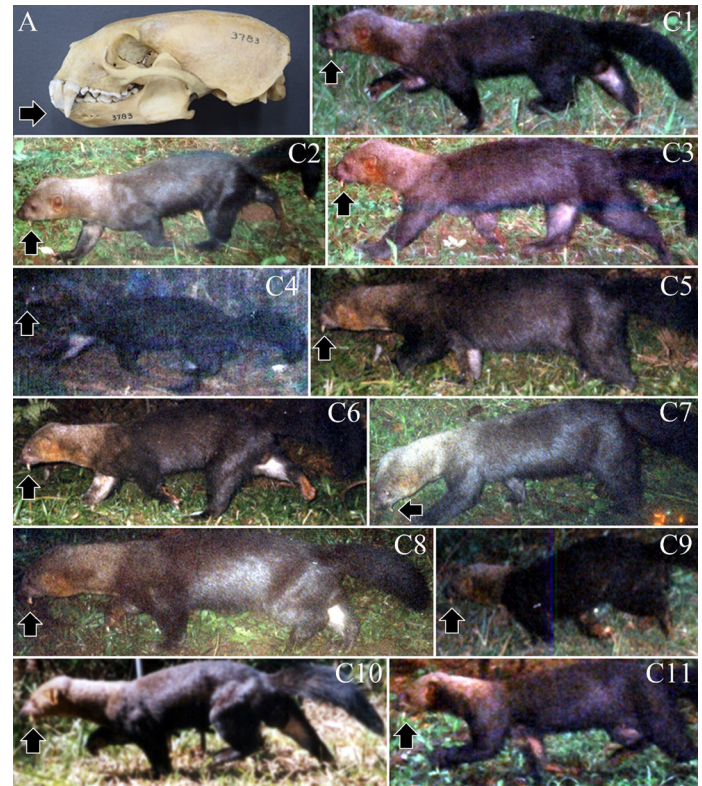
Figure 1. A) sagittal plane of a tayra ( Eira barbara ) skull with regular size canine (IIB-UV 3783). Capture (C) 1 to 11) Independent captures of tayra male with abnormal upper left canine. Arrow points at the distinctive feature.

On March 4 of 2012 at 16:48 hr, we recorded an adult male tayra (based on the presence of the testicles, which reach full growth at 18 months old; Poglayen-Neuwall 1975 ) with an overdeveloped upper left canine (Figure 1).