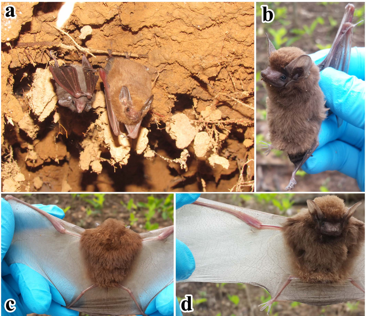
Figure 1. Photographs of live specimens of Peropteryx pallidoptera in Bolivia: a) roost where the bats were captured (bats photographed do not represent the specimen collected); b) lateral view of the specimen collected (MHNC-M 555); c) dorsal view showing translucent wings, pale brown arms, and brown interfemoral membrane; d) ventral view showing ears not connected by a band of skin and poorly developed wing sac on the leading edge of the propatagium.

tall; some were very deep, and others were shallow. On November 22, 2016, we observed a colony of bats in a root cavity (Figure 1a) and we manually captured two females with translucent wings. We collected one of the bats (sub-adult) following the guidelines by Sikes et al. (2016) , and we measured and released the other bat (pregnant female). External measurements recorded in the field were: total length (TL), tail length (T), hind foot length (HF), ear length (E), and forearm length (FA) in millimeters, and weight (W) in grams. We stored the specimen in alcohol and deposited it at the Museo de Historia Natural Alcide d'Orbigny (Cochabamba, Bolivia; MHNC-M 555). To confirm identification, we extracted and cleaned the skull, and measured it with a digital caliper to the nearest 0.01 mm. Cranial measurements taken were: greatest length of skull (GLS), condyloin-